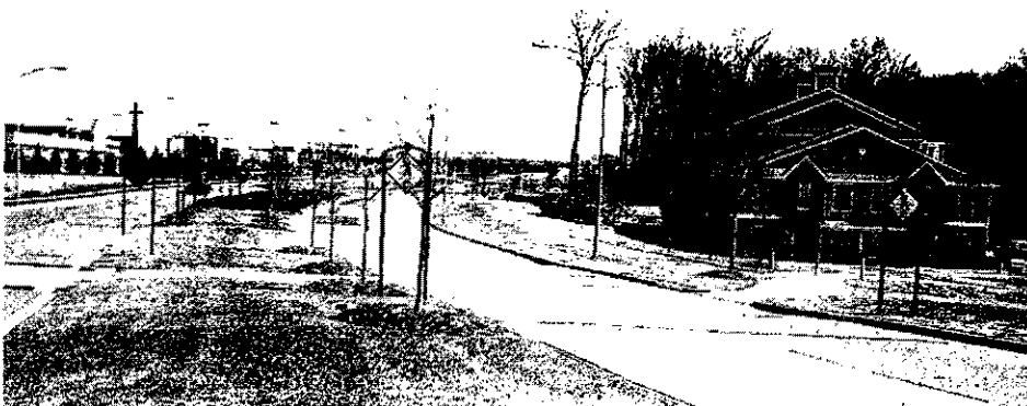
CROSSING THE DIVIDE - ATT rail-trail crossing at Renaissance Parkway. The new Streets of Southpoint Mall is in the left background. Sidewalks connect trail, new multi-unit housing and the regional mall.

The Dunn-Erwin Connector rail property was donated to NCRT two years ago by the Aberdeen & Rockfish Railroad and was placed in the federal railbank at that time. The local rail-trail committee is moving toward taking full responsibility for management and maintenance of the corridor. The goal is a paved trail between the two communities. Other improvements are proposed in a NC State University School of Design master plan which was funded by an Adopt-A-Trail grant from the state Trails Program.