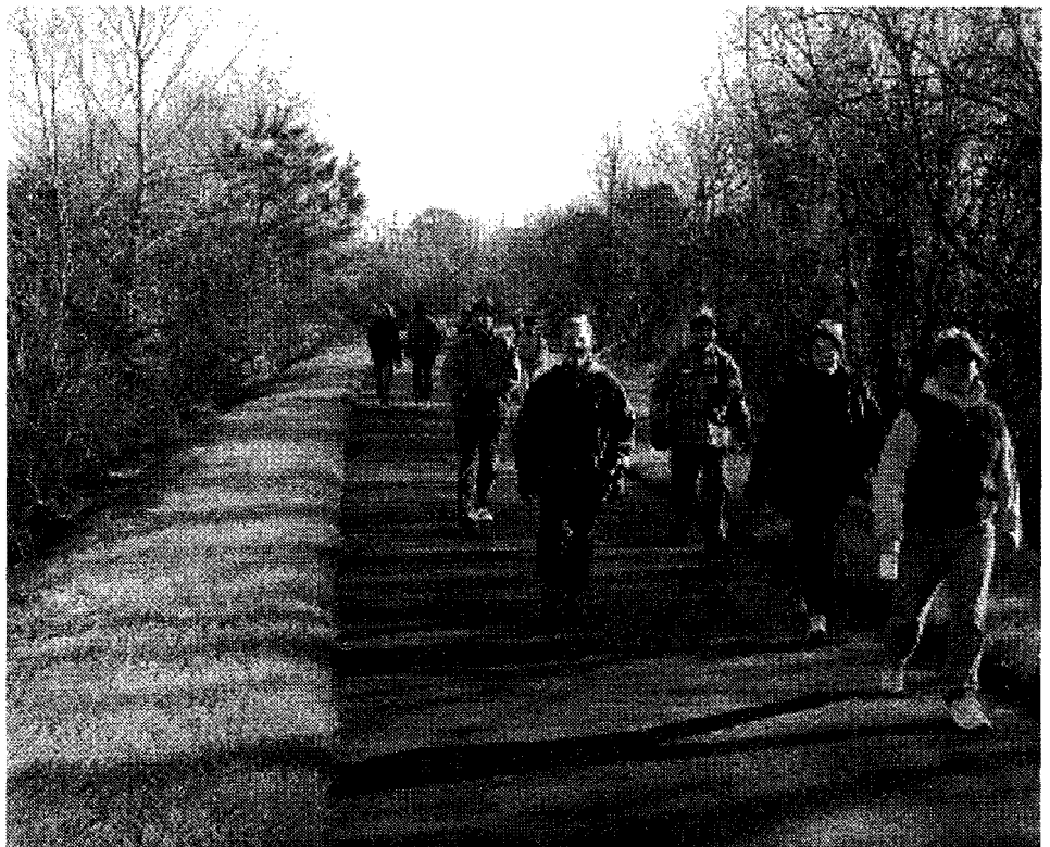
Volksmarchers hike Williamston's newly-completed Skewarkee Rail-Trail on a frosty morning.

In 1989 NCRT was instrumental in getting Durham County to request that Norfolk Southern preserve the railroad right-of-way in Durham County. The