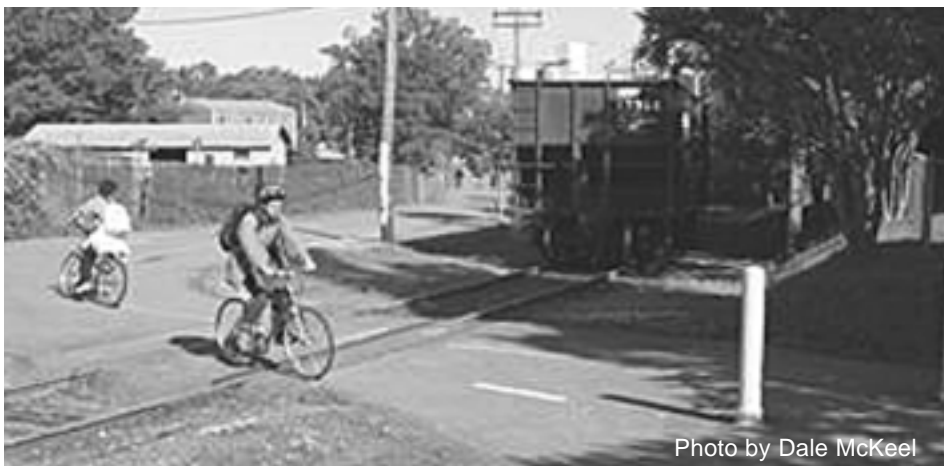
Two of the 4,000 daily bicyclists pedal along Carrboro's Libba Cotton Bikeway.

"Little Toot" was first published in September 1989. AL Capehart edited the first issue. James Mackay edited the next two issues. From the spring 1990 issue until the winter of 2006, Dan Arrasmith edited "Little Toot."