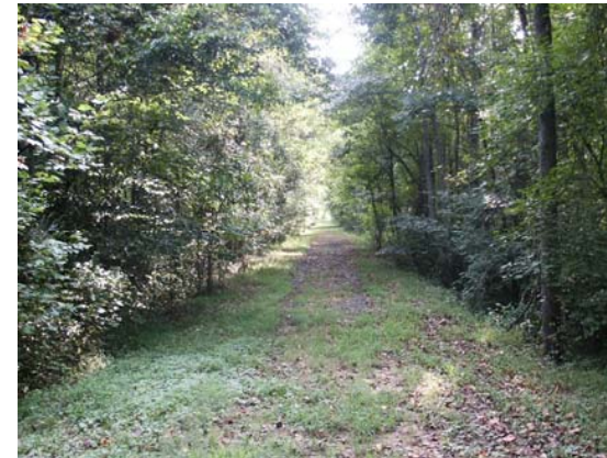
Photographs taken along the Deep River Rail-Trail by Perry Conner, September 2007

Successful rail-trails depend on addressing concerns from adjacent landowners and the public. These concerns may include trail acquisition, adjacent landowner property and privacy rights, trail security, trail liability, and hunting on the trail. Sensitivity to landowner and local concerns is critical to the development of successful trails.