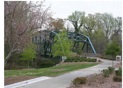
Greenville greenway : Tar River pedestrian bridge