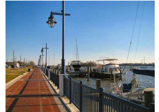
Washington waterfront